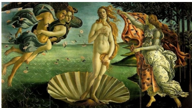
The Birth of Venus by Sandro Botticelli

So here's a question. We all know that Cupid is Valentine's Day's mascot. He is generally accepted to be the Greek patron deity of love. But is he though? Is he actually the Greek god of love? Well, yes and no. He is a god of love, but not the god of love. To have a look at the different gods and goddesses of love, we'll need to start with Aphrodite. Whether or not Aphrodite is a goddess is up for debate. She was born from the blood of the tyrant titan Chronos mixing with the sea. Because of her odd creation, she's not quite a titan, nor a goddess. She is, however, part of the major 13 deities making up the pantheon. Her domain is technically love, focused mostly on the lust aspect, as her domain equally envelopes beauty and sexuality.